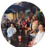
Festive Feast - Surry Hills Strawberry Hills Hotel, Surry Hills, 13/12/2021