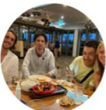
Festive Feast - Narrabeen The Sands Hotel, Narrabeen, 14/12/2021

It could also be good for some of our buddies as they can go somewhere that they are already familiar with.