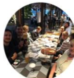
Festive Feast - Kirrawee Prince Hotel, Kirrawee, 8/12/2021

We also talked about doing the Christmas dinners again in different areas around Sydney. We talked about how this was a good way to avoid paying more money for more expensive venues.