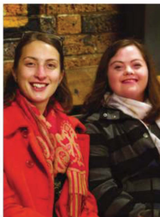
Local volunteers are needed to form friendships with youngsters on the peninsula.

Two servicing options will be selected to take forward to the commercial feasibility study. The study will consider whether the proposed options will be commercially viable in the long term, and may propose suitable operating models for the system.